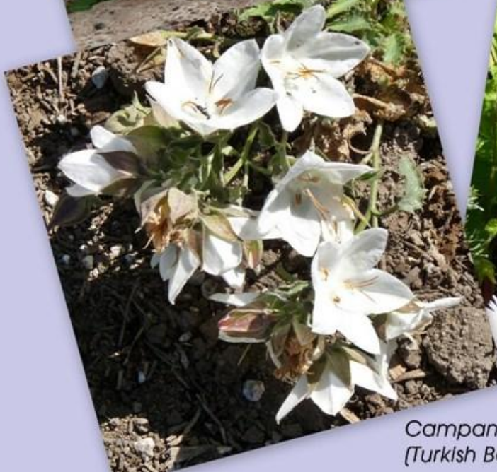
Campanula trogerae (Turkish Bellflower)

Since they originate in so many diverse regions, the growing conditions vary considerably, but I have found that in my Chiloquin garden I can grow many different bellflowers by giving them regular water and some sun. It's also fortunate that they like alkaline soil, because that is what I have. At present these are doing well for me here but I'm always on the lookout for a new bellflower.