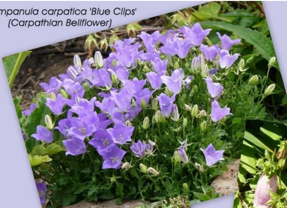
Campanula carpatica 'Blue Clips' (Carpathian Bellflower)